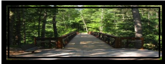
Dedication pavers will be placed at the aprons of the Ishnala Bridge.

The trail system on the Ishnala Property includes a 2.5 mile hiking trail and a 1/4 mile paved trail connecting the park to the Ishnala Restaurant.